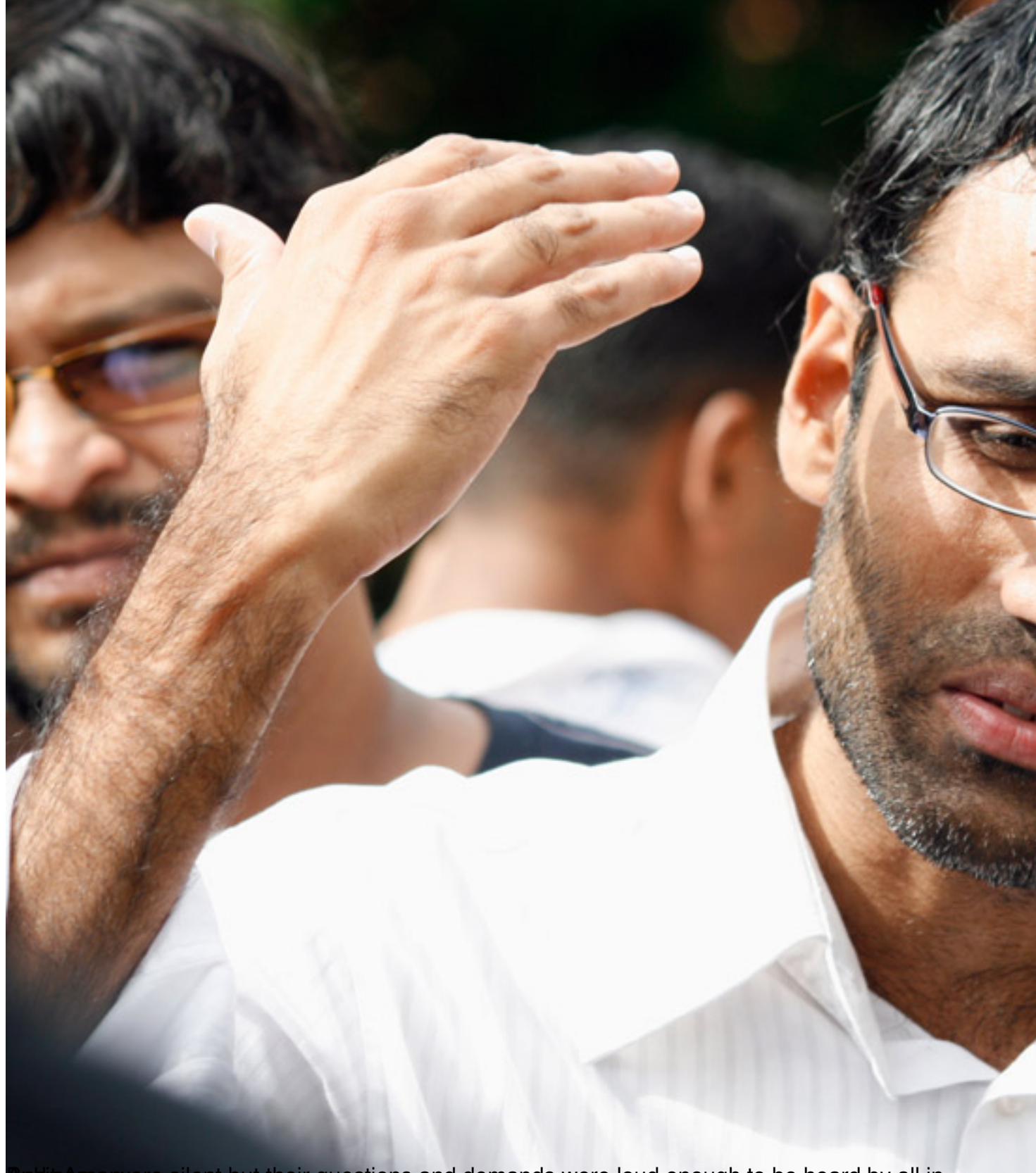
Written by Nanda Monday, 01 November 2010 19:32 - Last Updated Wednesday, 03 November 2010 00:20

BudisAmarwere silent but their questions and demands were loud enough to be heard by all in