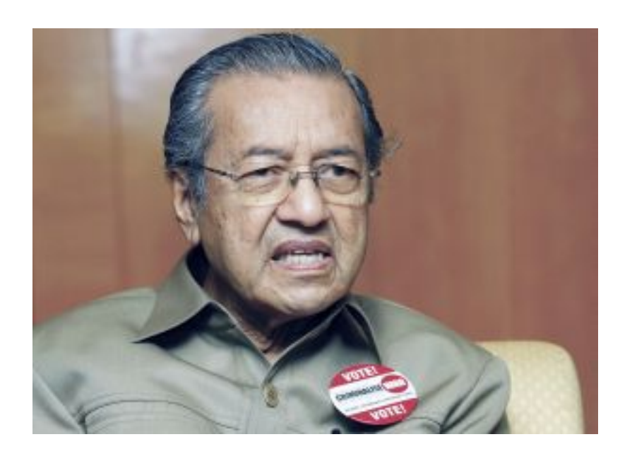
Dr M says 9/11 attacks staged to hit Muslim world