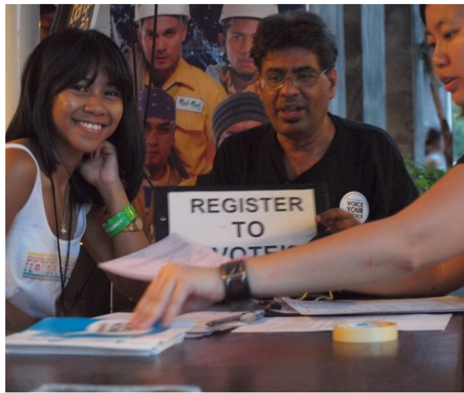
UPDATE: At Urbanscapes yesterday, Saya Anak Bangsa Malaysia and <u>EPIC</u> registered 316 new voters. Both groups are not aligned to any political party.

KUALA LUMPUR, June 27 — With more than four million eligible voters yet to be registered, political parties are now in a hurry to get them on the electoral rolls ahead of the next general election due in 2013.