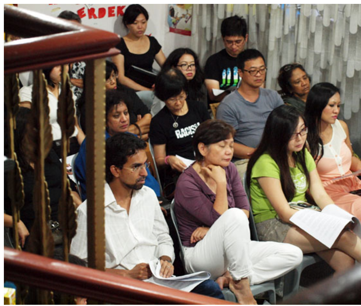
FOLLOWING up on the previously held dialogue session with political parties' representatives on the proposed Social Inclusion Act 2012, SABM and HAKAM held another dialogue session on 27<sup>th</sup> October 2012 on the same subject with representatives from Civil Society Organisations, and also interested members of public.

In an engaging and stimulating discussion that followed the presentation by SABM-HAKAM,