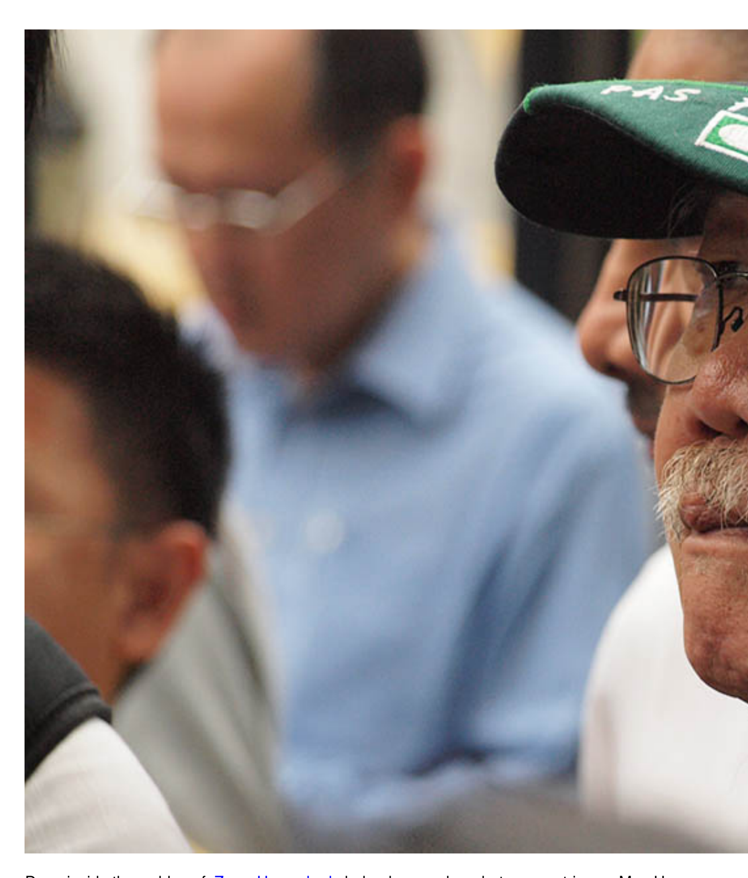
Deep inside the weblog of Zorro-Unmasked , lodged somewhere between entries on Man U,