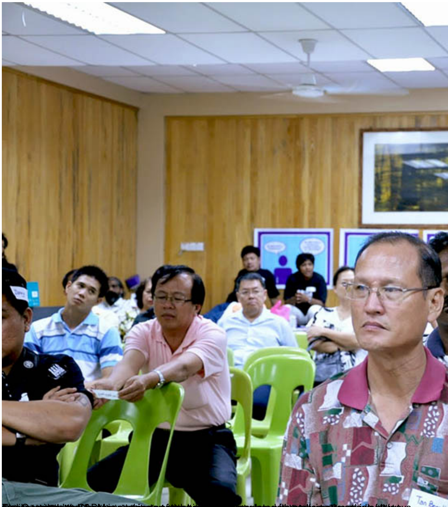
Strait Times photo of SABM roadshow attendees in Melaka, Malaysia, 31 March 2010.