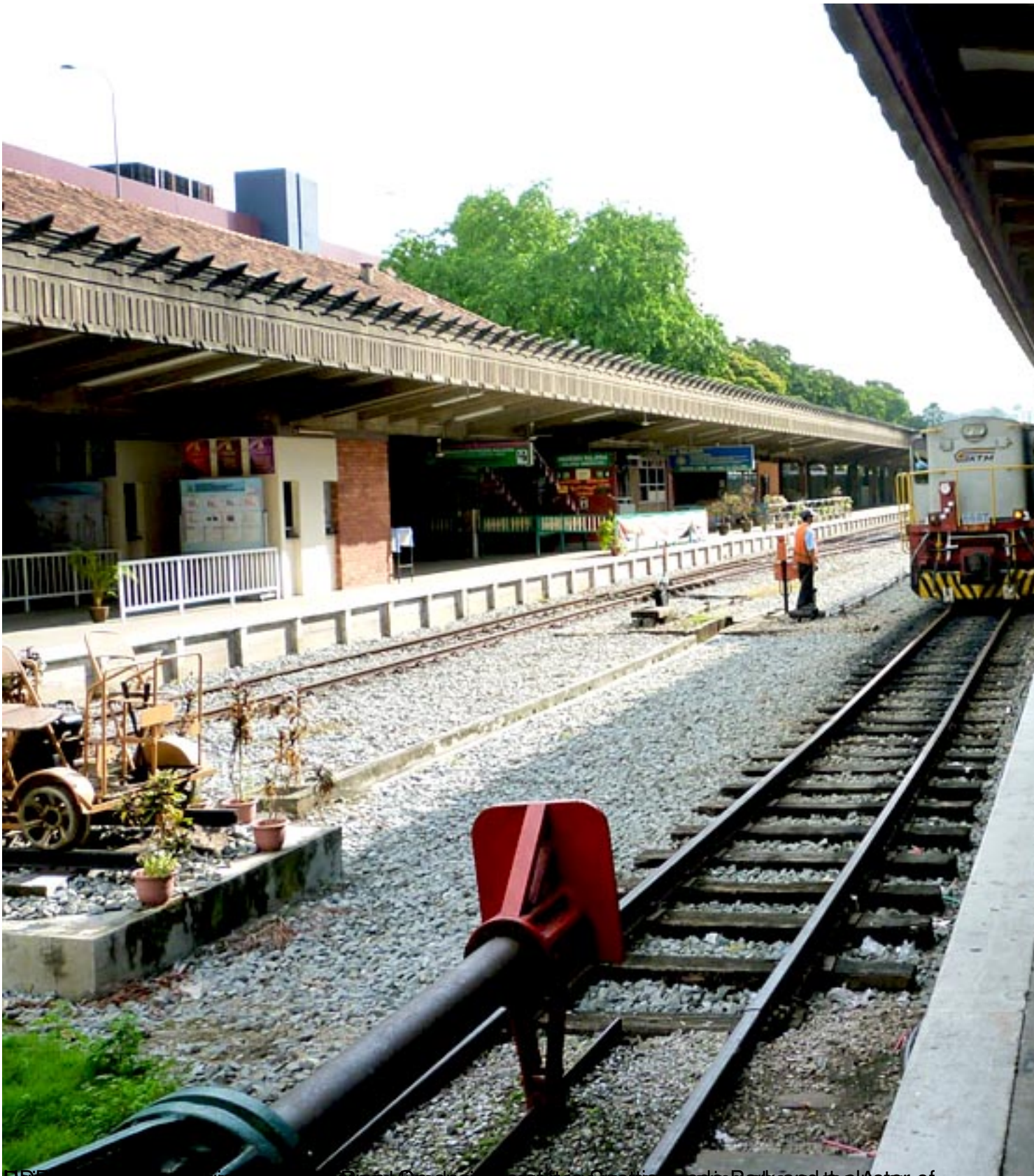
High speedway over the Keppel Road bridge is now a road bridge, with the bridge above the line of the Tg Pagar line.