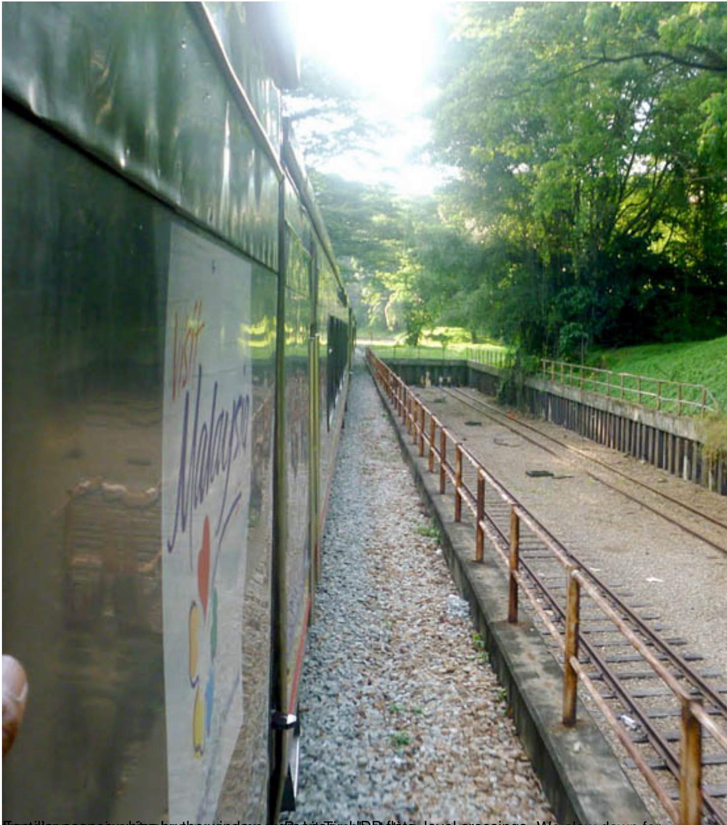
Familiar passing which by the approach of Bekit Tj, and B. flats, level crossings. We slow down for the usual passing which by the approach of Bekit Tj, and B. flats.