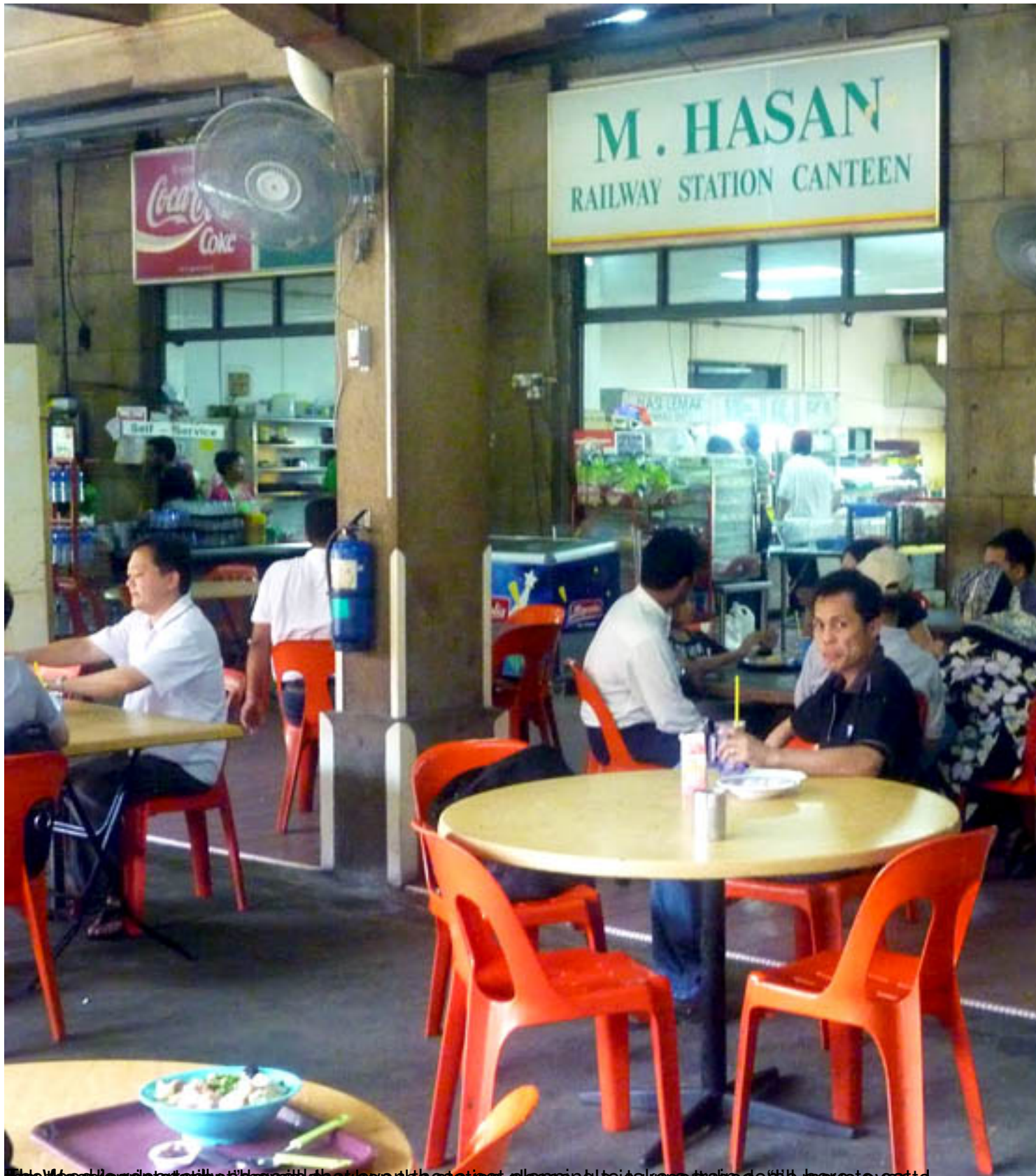
The M. Hasan Railway Station Canteen, before the station closes to take the train to the new station.