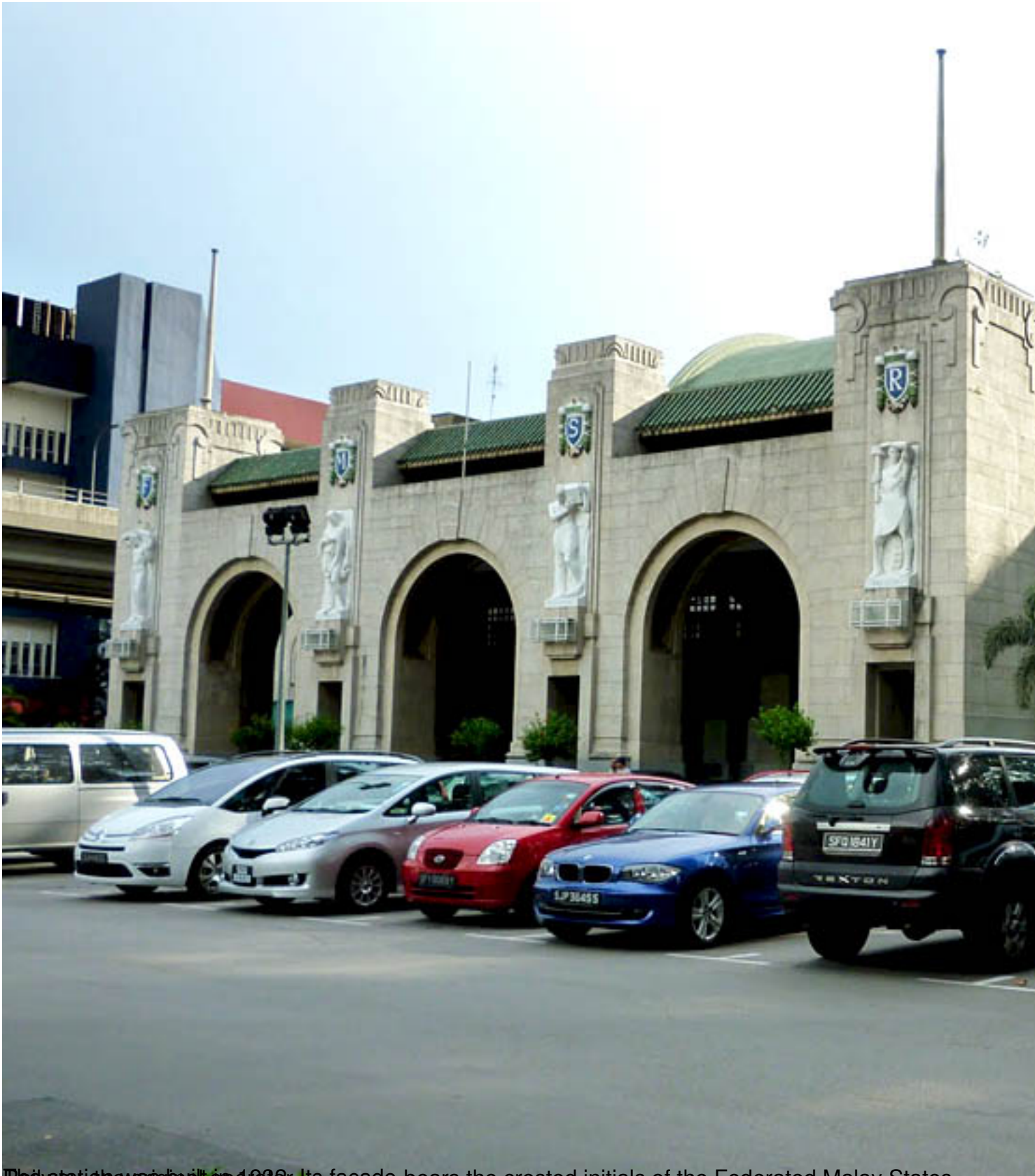
This station was built in 1932. Its facade bears the crested initials of the Federated Malay States Railway, the original operator.