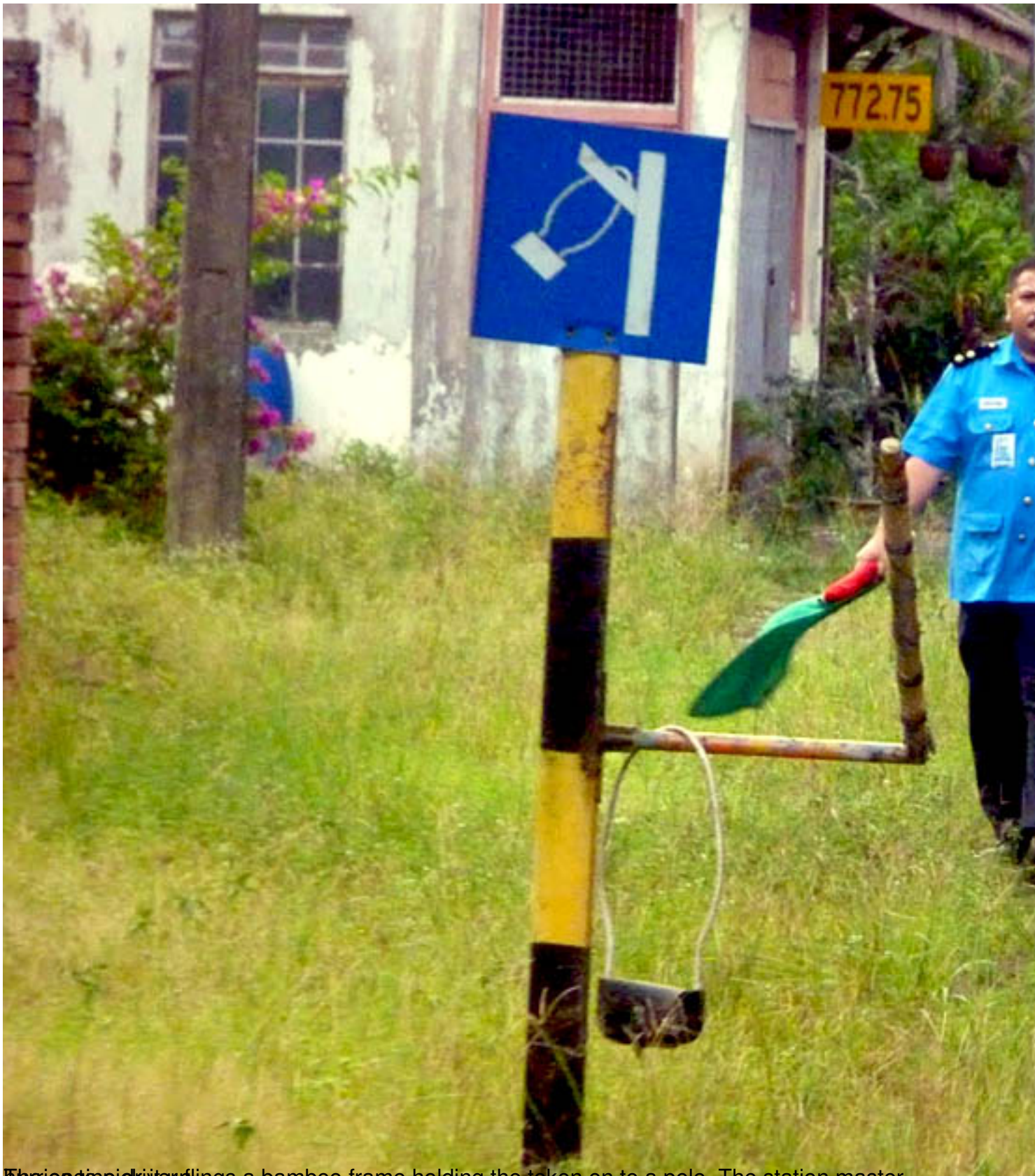
The station master is putting a bamboo frame holding the token on to a pole. The station master